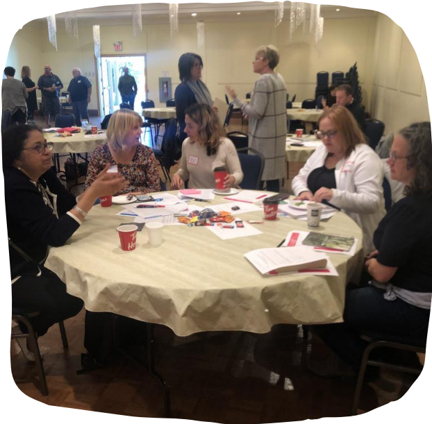
NSACL participated in the Families for Inclusive Education NS Forum.