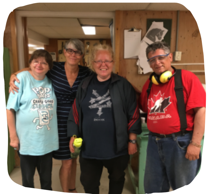
NSACL visits Clare ACL and Fancy Nancy's Cleaning Service's team.