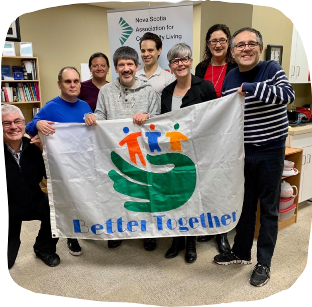
The Better Together team visits NSACL.