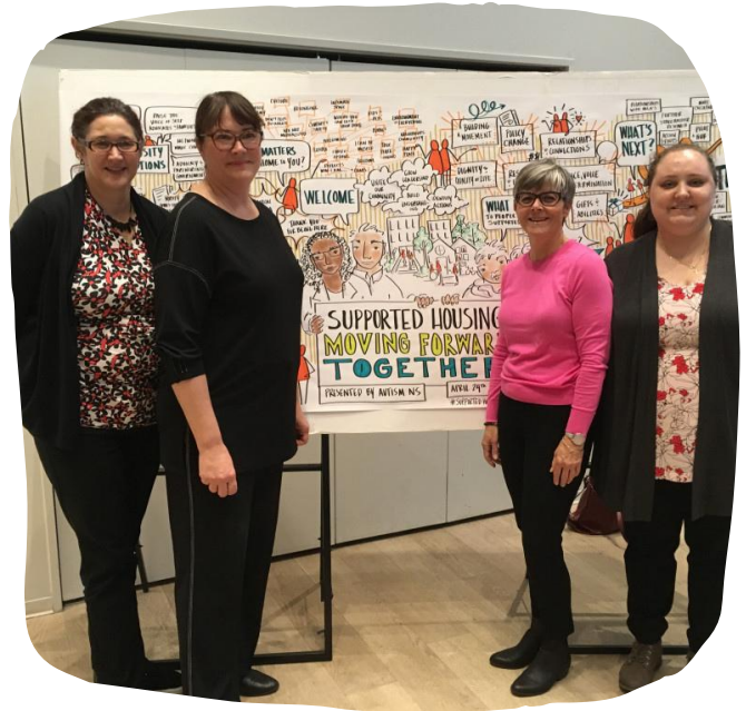
NSACL participated in the Supported Housing Summit.