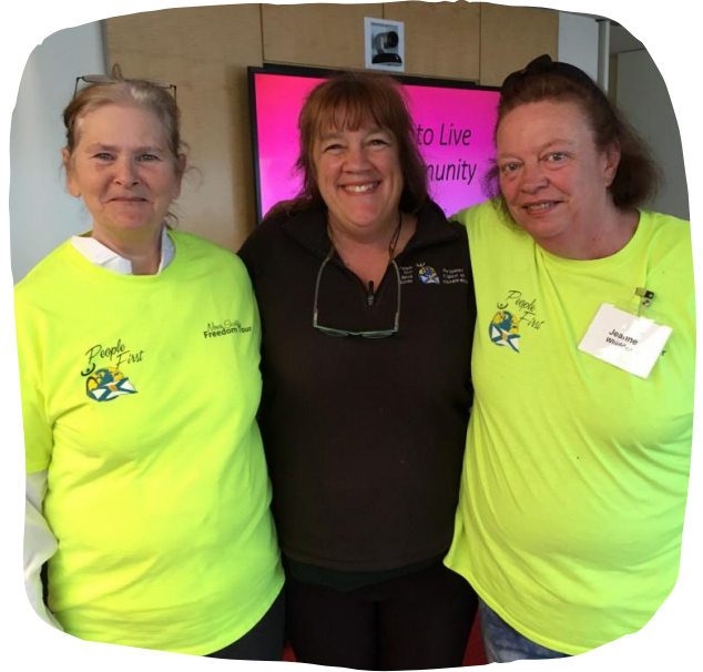
NSACL attended the UN Special Rapporteur on the Rights of Persons with Disabilities visit to NS.