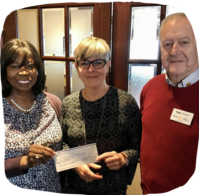
The Rotary Club of Halifax Harbourside presents NSACL with a donation.