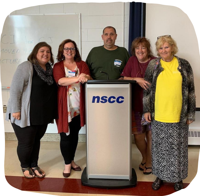
As part of the Truths of Institutionalization project, NSACL participated in five forums across NS.