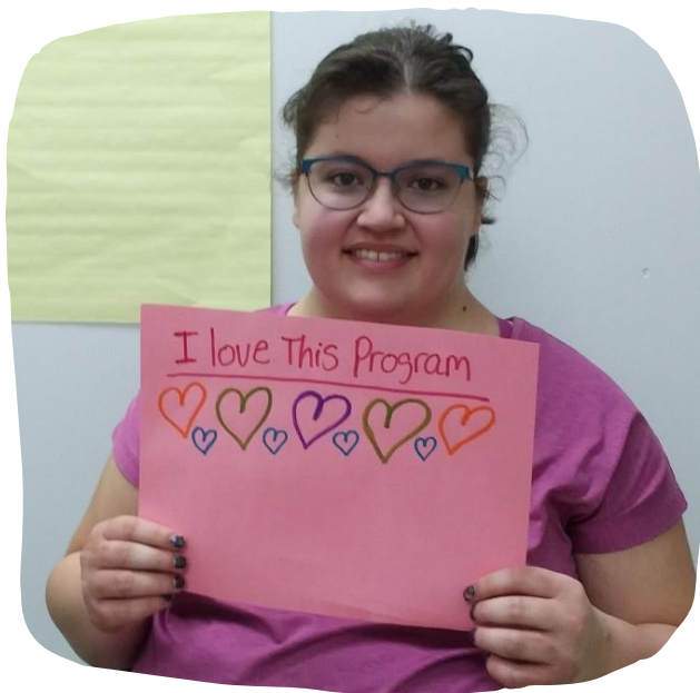
A Life Transitions to Work participant shares her love for the program.